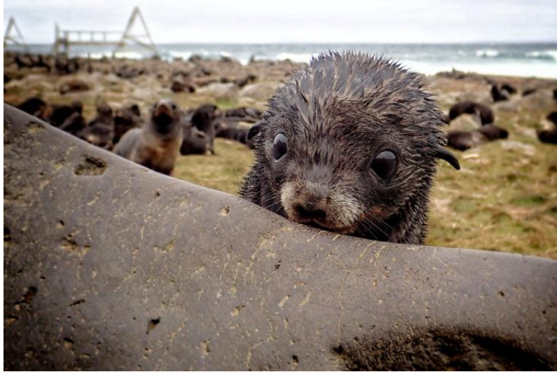
Figure 1. A northern fur seal pup visits scientists hiding behind a rock on St Paul Island.

4. The Bering Sea and Aleutian Islands pollock trawl fishery disrupts this important feeding behavior. Each year, the fishery removes hundreds of thousands of tons of pollock from northern fur seal foraging habitat and disperses the schools of pollock that remain. This prevents lactating females from sufficiently feeding their pups, resulting in reduced pup survival and other harms.