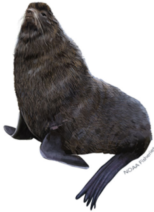
Figure 2. Adult male fur seal illustration.

47. Northern fur seals are a pelagic pinniped, meaning they spend the majority of the year in the ocean. In the winter months, they generally migrate southward to the North Pacific Ocean. In the spring months, the seals begin a northerly migration to breeding colonies in the Bering Sea. During the summer months, the seals then congregate on land to breed, give birth, and nurse their pups. Males typically arrive at breeding grounds in May and depart in August, while females arrive at breeding grounds in June and depart in November.