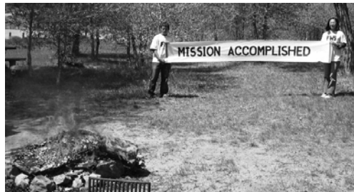
Activists' vigil over grayling "funeral pyre"