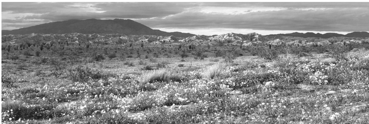
Wildflowers at Anza-Borrego Desert State Park