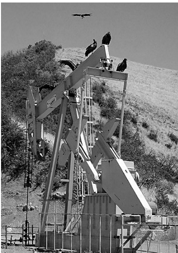
California condors on oil rig, Los Padres National Forest

Three months after a major oil spill in California's Los Padres National Forest, the Center, Defenders of Wildlife, and Los Padres ForestWatch filed a lawsuit in April contesting Bush administration plans to expand oil and gas drilling that would significantly harm the area's wildlife.