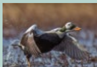
EIDER ON THE COVER