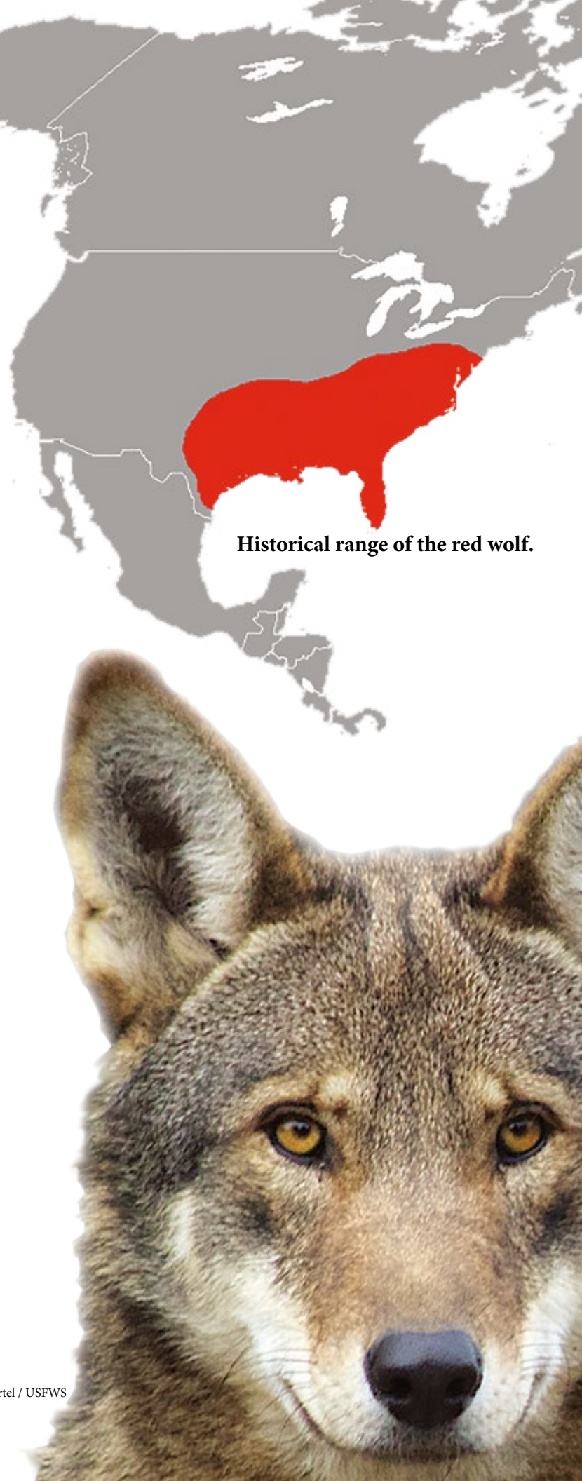
Historical range of the red wolf.